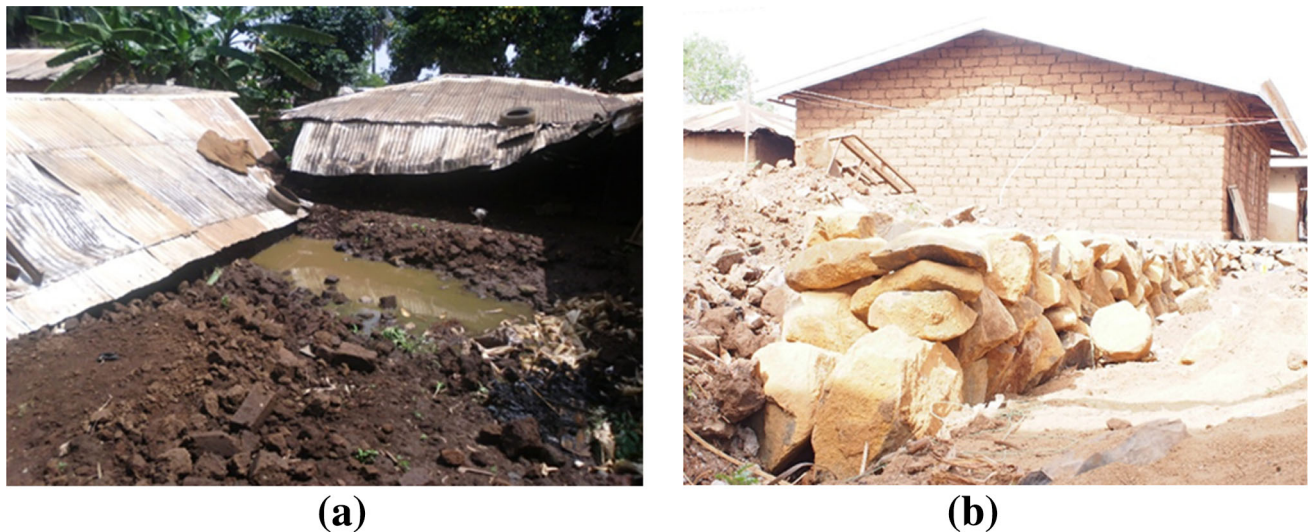
Fig. 2 Three years after the 2012 flood in Babessi—reconstruction of destroyed mud-brick houses still ongoing. a Destroyed mud-brick houses after the flood in 2012; b Reconstruction of houses with stone-

reinforced foundation ongoing, in 2015.