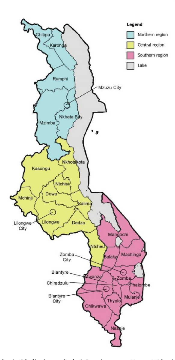
FIGURE 1 Map of Malawi with districts and administrative zone. [Colour figure can be viewed at wileyonlinelibrary.com

We use pooled cross-sectional data from the Malawi DHS for 2004/05, 2010, and 2015/16. The data are representative of households within the 26 main districts in Malawi (see Figure 1). For detailed insight into the DHS sampling strategy see Croft et al. (2018). Our cross-sectional datasets are limited to households with women who indicated that they were employed or selfemployed in agriculture in all three timeframes of the Malawi DHS. Going forward, we describe