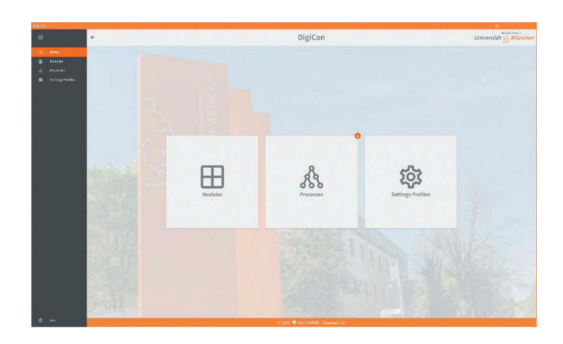
Figure 3. Image of DigCon platform.

DigiCon is a software platform developed as part of the "Digital Performance Contracting Center" research project at the University of the Bundeswehr Munich, see Figure 3. The software is still under development. Its aim is to digitally model the mechanisms and processes in public procurement developed in the research project. The Contractor Involvement Tool (CIT) uses the DigiCon platform as a base to model and depict the whole involvement process.