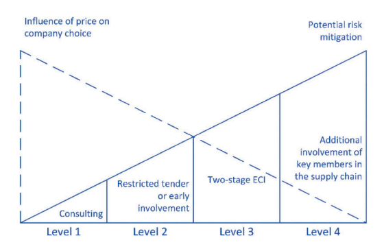
Figure 1. Level of Involvement based on (PIANC 2022).

in a two-stage procedure and the design is carried out jointly. At level 4, in addition to the execution. In Level 4, the expertise of other key companies in the supply chain is used in addition to the execution expertise of the construction company. From Level 1 to Level 4, the importance of the construction price in the selection of project partners decreases, while at the same time the risk mitigation increases from Level 1 to Level 4.