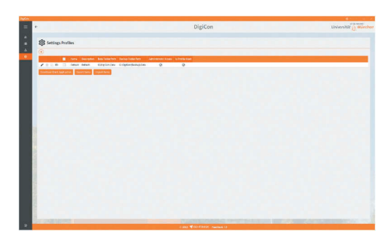
Figure 4. Module creation in DigiCon.

DigiCon enables the use to create modules and connect them in a process as they see fit. It also gives the opportunity to choose the logic when combining different modules, shown in Figure 4.